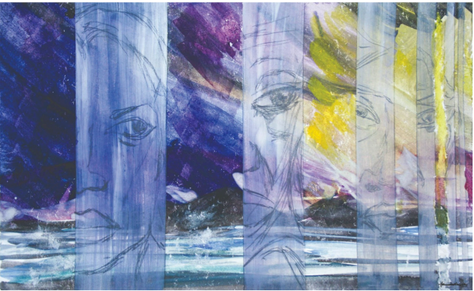
Watercolor & graphite on paper Inspired by Daniel 3