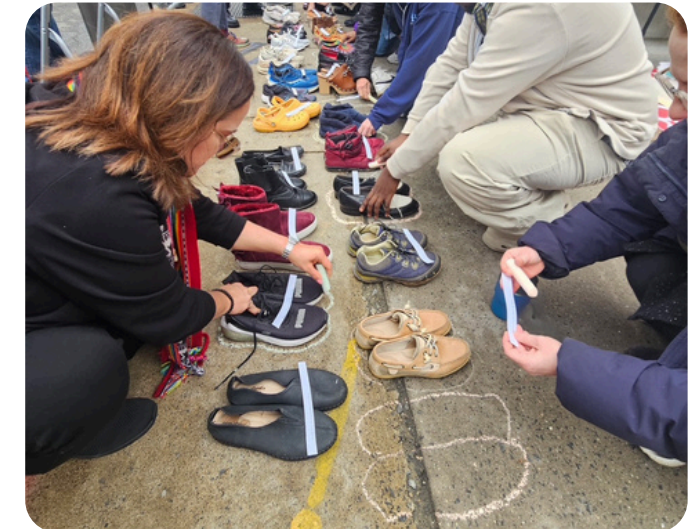
Good Friday Vigil where we retraced empty shoes representing those left behind by individuals who have died in ICE detention this year